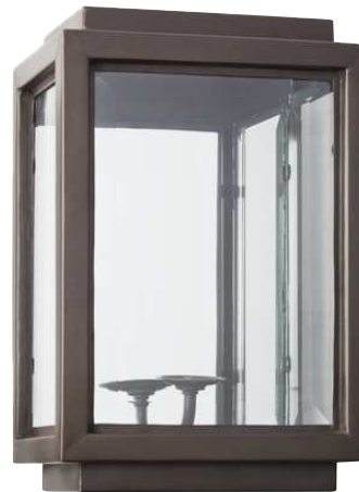
Type II - Clear Bevelled