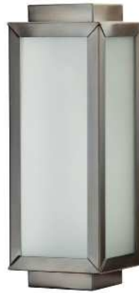
Type I - Frosted

Installation: Light On Landscape strongly recommend that all luminaires be correctly installed and maintained. Failure to do so will result in the voiding of the manufacturer's warranty and the reduced efficiency, performance and life of the fixture. To eliminate voltage drop, we advise that the recommended UV stabilized cable and run lengths are used, along with soldered joints, heat shrink connectors and quality lamps.